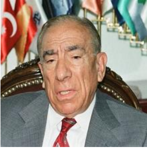
Alparslan Türkeş Founder, deceased