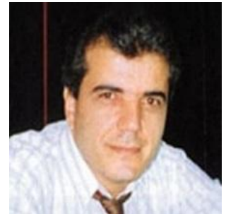
Abdullah Çatlak Deputy leader of Ülkü Ocakları in the 1970s, hitman, Turkish Secret Police officer, deceased