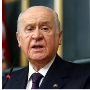
Devlet Bahçeli Chairman of Nationalist Movement Party (MHP)